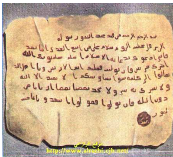
رسالة الرسول صلى الله عليه وسلم الى قيزار قيصر الروم

Al-Bukhari gave a long narration of the contents of the letter sent by the Prophet ﷺ to Hercules, king of the Byzantines: